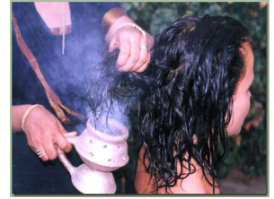
Herbal Hair Care